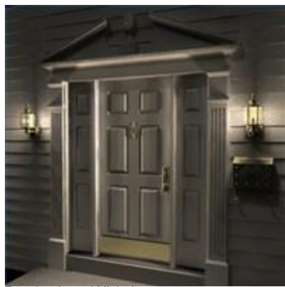
Doorknob and Kickplate

Updating the look of the exterior of your home can be as simple as changing the hardware to your front door.